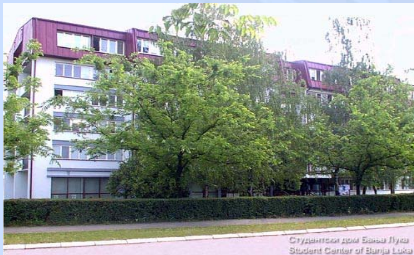
Студентски дом Бања Лука Student Center of Banja Luka