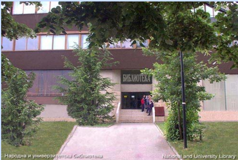
Народна и универзитетска библиотека